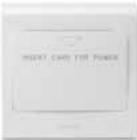
Key Fob Switch